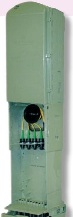
Fiber Distribution Closure (shown with environmentally hardened drops)

NetSpan™ Fiber Distribution Pedestals and Closures provide a configurable platform for diverse FTTP deployment.