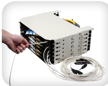
The Rapid fiber panel, with its innovative RapidReel fiber cable spool, greatly accelerates fiber installation.

Incorporating the intermediate distribution panel and the micro cable into a single product using the RapidReel™ fiber cable spool, allows installers to pull out just the length of cable required and leave any slack stored on the internal spool. The RapidReel fiber cable spool enables the panel to be ordered in 100' increments up to 1,000' dramatically simplifying product selection and ordering.